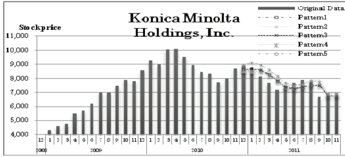
Figure 3: Forecasting Results of KONICA MINOLTA HOLDINGS, INC.

Variance of forecasting error is exhibited in Table 5.